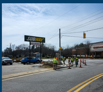
A photo of crews working on New Leicester Highway Sidewalks near the Land of Sky office