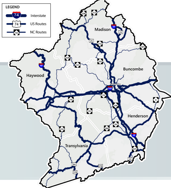
INTERSTATES, U.S., AND N.C. ROUTES

Interstates, US routes, and NC routes represent about 7% of the roadway network in the 5 County total, but more than 61% of fatal and serious crashes occurred on these roads